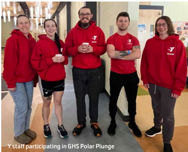
Y staff participating in GHS Polar Plunge

Hours/Schedule to change without notice. Check our website and Facebook for facility updates.