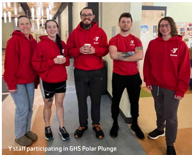
Y staff participating in GHS Polar Plunge

Hours/Schedule to change without notice. Check our website and Facebook for facility updates.